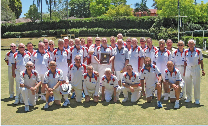
WPH wins the inaugural Zone 10 Encouragement Award in November 2016